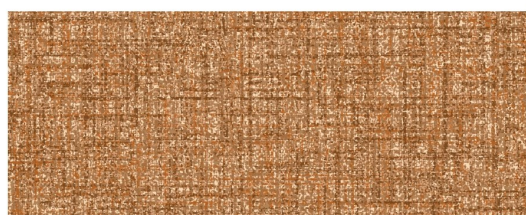
Bamburgh SBA10 Brick (showing width: 34cm)