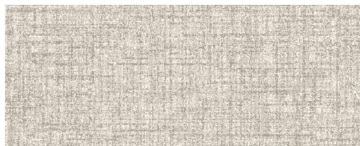
Bamburgh SBA02 Buckle (showing width: 34cm)