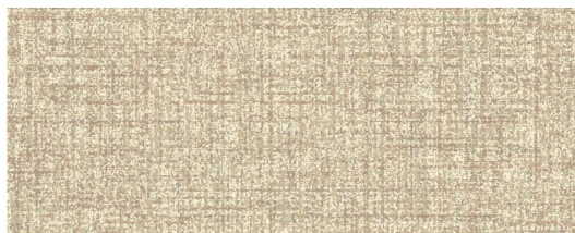
Bamburgh SBA01 Whelk (showing width: 34cm)

Sample swatch attached shows SBA03 Florin on Ashford base-cloth.