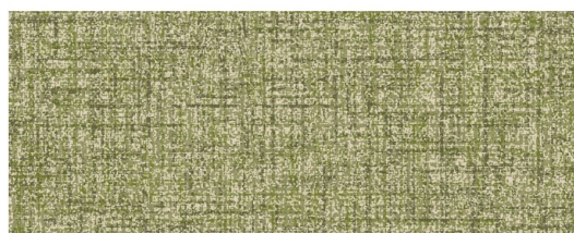
Bamburgh SBA08 Terrarium (showing width: 34cm)