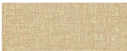
Bamburgh SBA09 Haybale (showing width: 34cm)