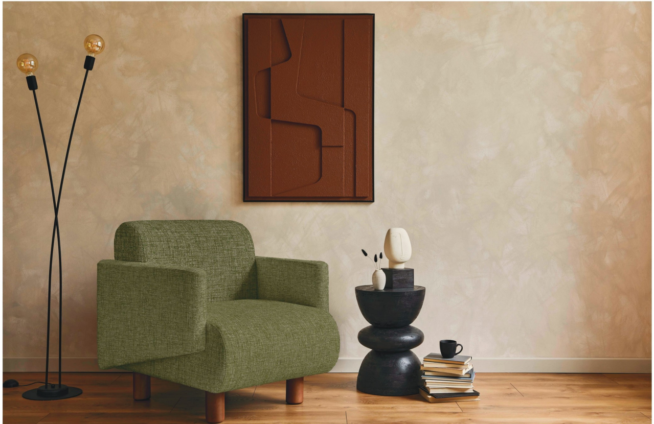
Image shows Bamburgh SBA08 Terrarium on chair

All of Skopos printed designs are available on a wide choice of base-cloths, including velvets, waterproof upholstery fabrics, blackout fabrics and linen-looks. For details, please refer to our website. Skopos can also provide bespoke colour options for a minimum order quantity. Please contact us for further details.