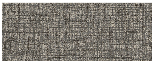
Bamburgh SBA04 Cannonball (showing width: 34cm)