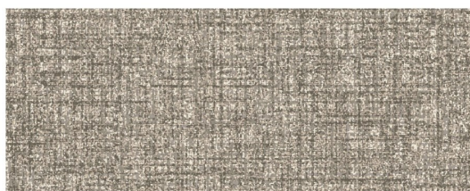
Bamburgh SBA03 Florin (showing width: 34cm)