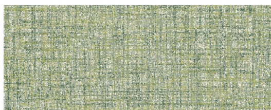
Bamburgh SBA07 Botanical (showing width: 34cm)