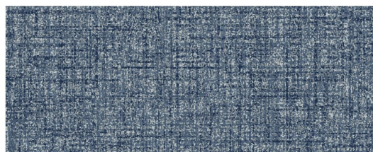
Bamburgh SBA06 Blueprint (showing width: 34cm)