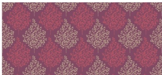
Birnam FS7 Tayberry (showing width: 137cm)

For exact colour reference, please order a sample: skoposfabrics.com