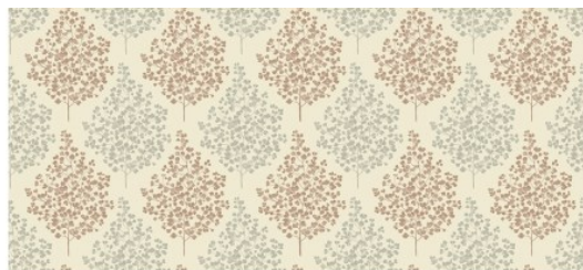
Birnam FS2 Blossom (showing width: 137cm)