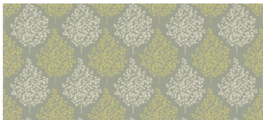
Birnam FS1 Camomile (showing width: 137cm)

Sample swatch attached shows FS5 Bluebird on Panama base-cloth.