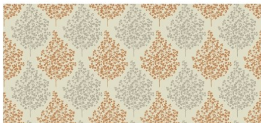
Birnam FS6 Fox (showing width: 137cm)