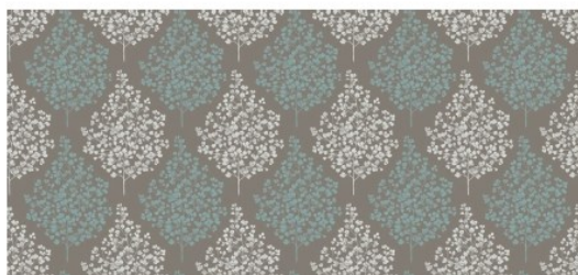
Birnam FS4 Brook (showing width: 137cm)