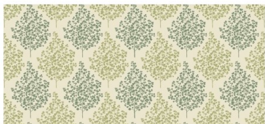
Birnam FS3 Sage (showing width: 137cm)