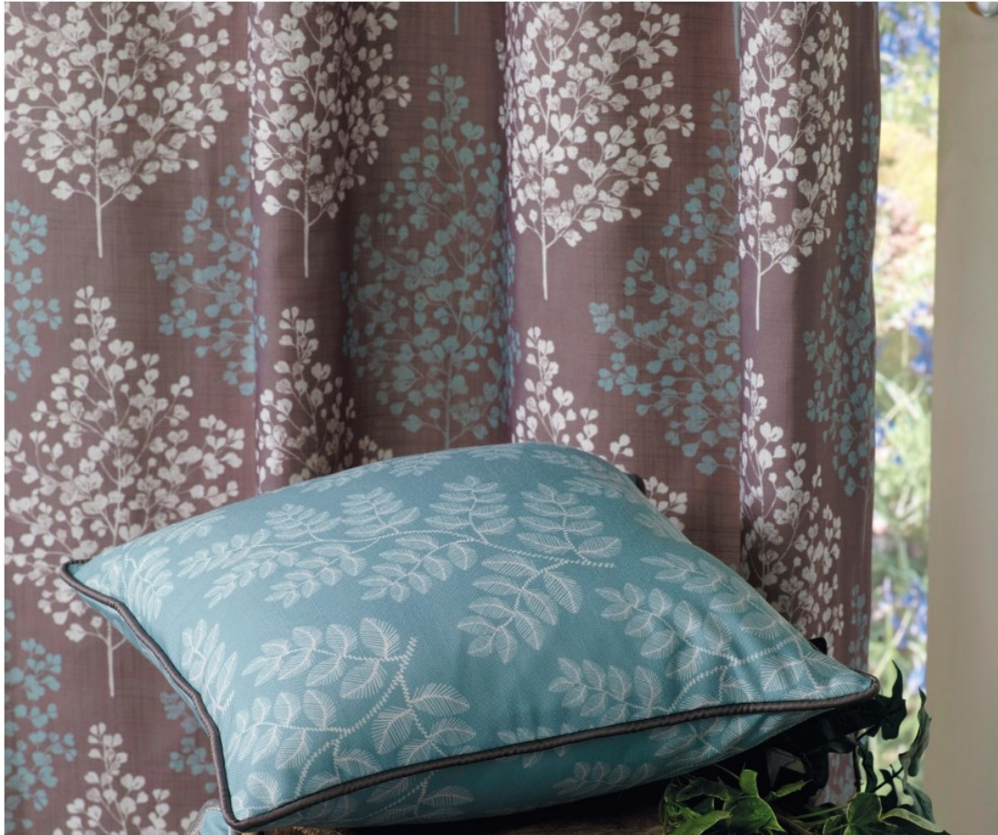
Image shows Birnam FS4 Brook on curtain and Wisley FS35 Brook on the cushion.

All of Skopos printed designs are available on a wide choice of base-cloths, including velvets, waterproof upholstery fabrics, blackout fabrics and linen-looks. For details, please refer to our website. For other designs within Flores Silvestri; please review the collection on the website. Skopos can also provide bespoke colour options for a minimum order quantity.