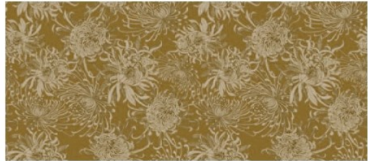
Bloem SB2 Nectar (showing width: 137cm)