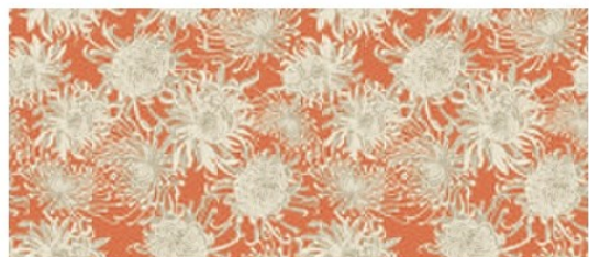
Bloem SB8 Lobster (showing width: 137cm)

For exact colour reference, please order a sample: skoposfabrics.com