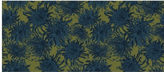
Bloem SB1 Olive (showing width: 137cm)

Sample swatch attached shows SB6 Anchor on Ashford base-cloth