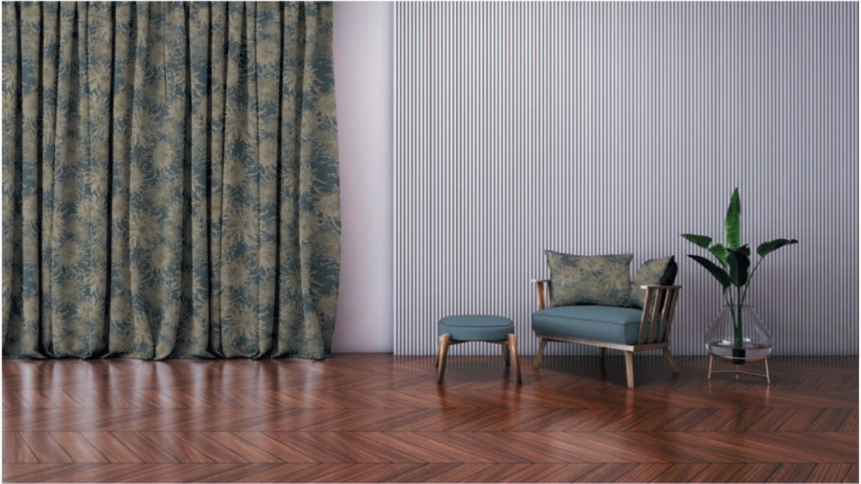
Image shows Bloem SB6 Anchor on curtains and cushions and Dove Slate on upholstery.

All of Skopos printed designs are available on a wide choice of base-cloths, including velvets, waterproof upholstery fabrics, blackout fabrics and linen-looks. For details, please refer to our website. Skopos can also provide bespoke colour options for a minimum order quantity. Please contact us for further details.