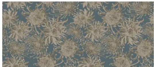
Bloem SB6 Anchor (showing width: 137cm)