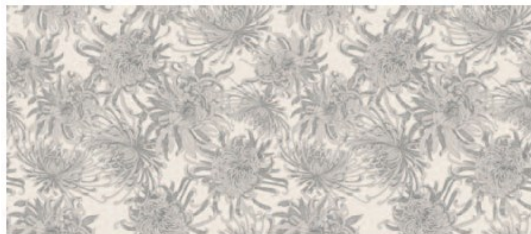
Bloem SB5 Flint (showing width: 137cm)