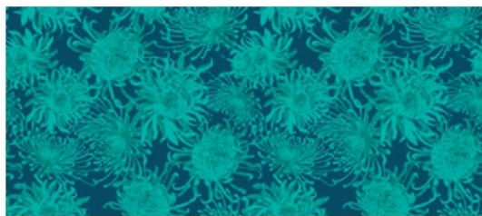
Bloem SB3 Cyan (showing width: 137cm)