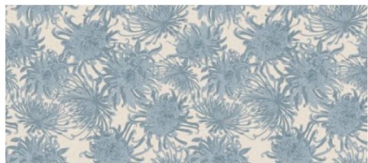
Bloem SB4 Sky (showing width: 137cm)