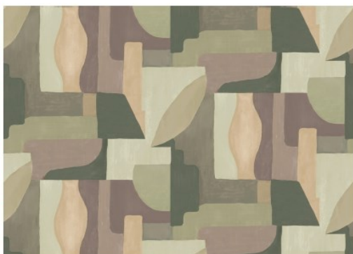
Cubist SC3 Amethyst (showing width: 137cm)