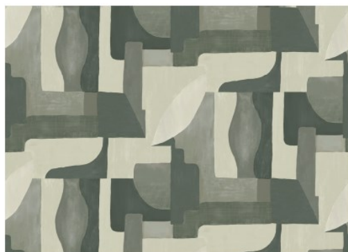
Cubist SC4 Tuxedo (showing width: 137cm)