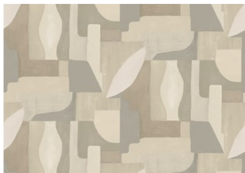
Cubist SC2 Mineral (showing width: 137cm)