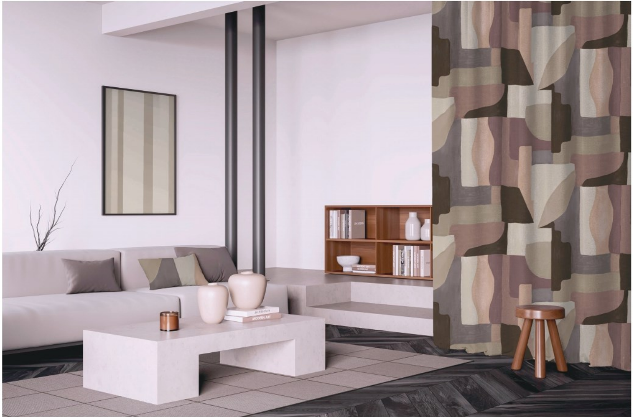
Image shows Cubist SC3 Amethyst on curtain..

All of Skopos printed designs are available on a wide choice of base-cloths, including velvets, waterproof upholstery fabrics, blackout fabrics and linen-looks. For details, please refer to our website. Skopos can also provide bespoke colour options for a minimum order quantity. Please contact us for further details.