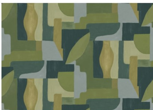
Cubist SC5 Matcha (showing width: 137cm)