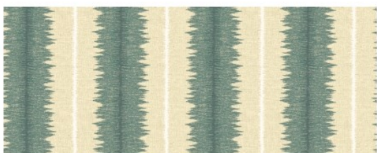
Fenix SF7 Agave (showing width: 45.6cm)