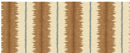
Fenix SF5 Chestnut (showing width: 45.6cm)