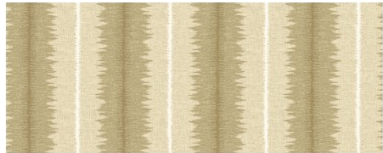
Fenix SF2 Macadamia (showing width: 45.6cm)