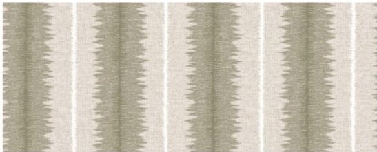
Fenix SF1 Porcini (showing width: 45.6cm)

Sample swatch attached shows SF5 Chestnut on Ashford base-cloth.