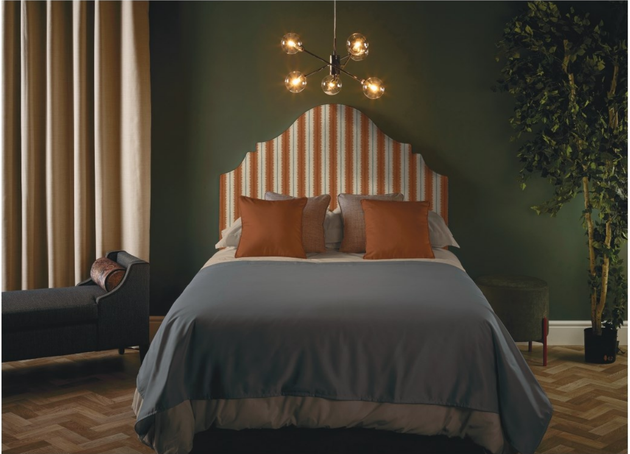
Image shows Fenix SF5 Chestnut on headboard.

All of Skopos printed designs are available on a wide choice of base-cloths, including velvets, waterproof upholstery fabrics, blackout fabrics and linen-looks. For details, please refer to our website. Skopos can also provide bespoke colour options for a minimum order quantity. Please contact us for further details.