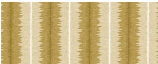
Fenix SF3 Guava (showing width: 45.6cm)