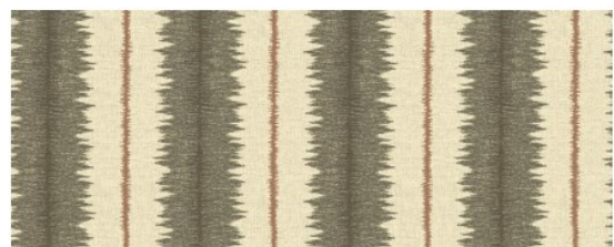
Fenix SF10 Truffle (showing width: 45.6cm)