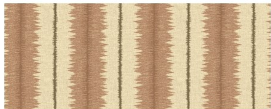
Fenix SF4 Melba (showing width: 45.6cm)