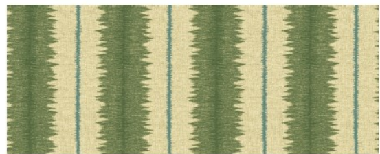
Fenix SF6 Galia (showing width: 45.6cm)