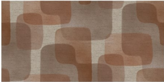
Forme SF3 Auburn (showing width: 68.5cm)