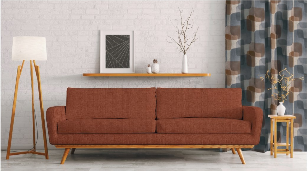
Image shows Forme SF5 Jay on curtains and Lienzo SL12 Cinnamon on upholstery.

All of Skopos printed designs are available on a wide choice of base-cloths, including velvets, waterproof upholstery fabrics, blackout fabrics and linen-looks. For details, please refer to our website. Skopos can also provide bespoke colour options for a minimum order quantity. Please contact us for further details.