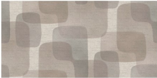
Forme SF1 Desert Grey (showing width: 68.5cm)

Sample swatch attached shows SF3 Auburn on Panama base-cloth.