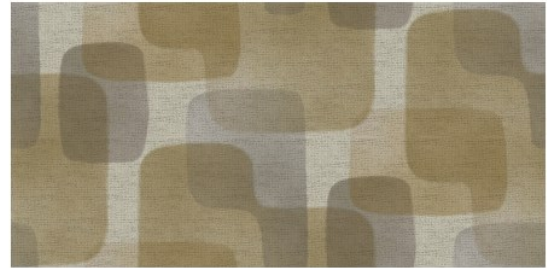
Forme SF4 Vintage Yellow (showing width: 68.5cm)