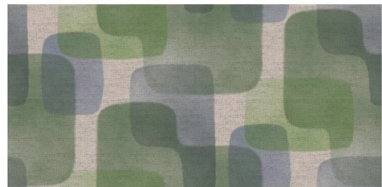
Forme SF8 Clover (showing width: 68.5cm)

For exact colour reference, please order a sample: skoposfabrics.com