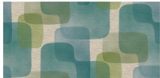
Forme SF6 Island Blue (showing width: 68.5cm)