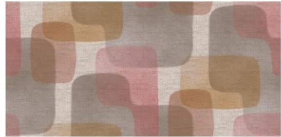
Forme SF2 Sweet Pea (showing width: 68.5cm)