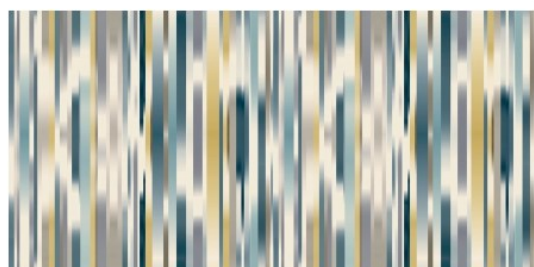
Foss LA28 Tundra (showing width: 68.5cm)