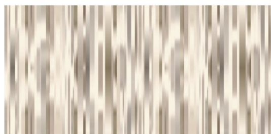
Foss SFS32 Date (showing width: 68.5cm)