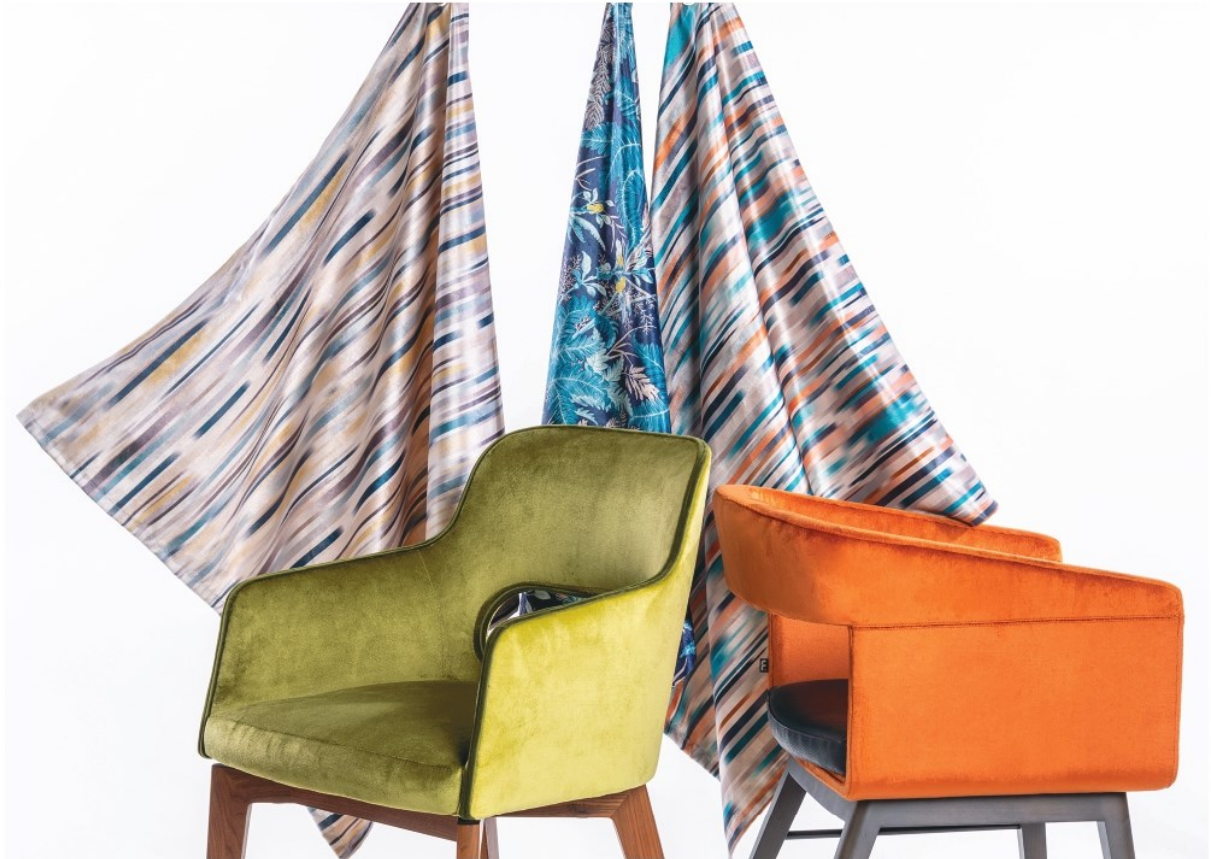
Image shows Foss LA28 Tundra, Palmyra SR23 Oceanic and Foss LA29 Kingfisher on drapes and Beau B24 Artichoke and Beau B20 Blaze on chairs.

All of Skopos printed designs are available on a wide choice of base-cloths, including velvets, waterproof upholstery fabrics, blackout fabrics and linen-looks. For details, please refer to our website. Skopos can also provide bespoke colour options for a minimum order quantity. Please contact us for further details.