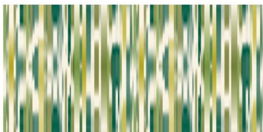
Foss SFS29 Gecko (showing width: 68.5cm)