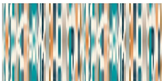
Foss LA27 Kingfisher (showing width: 68.5cm)

Sample swatch attached shows LA27 Kingfisher on Turin base-cloth.