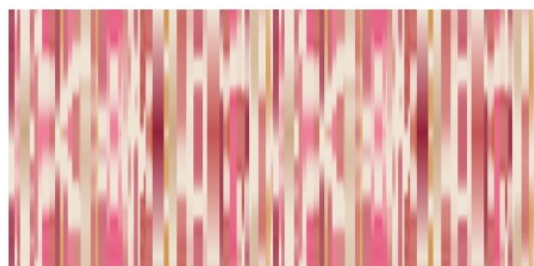
SFS34 Rhubarb (showing width: 68.5cm)

For exact colour reference, please order a sample: skoposfabrics.com