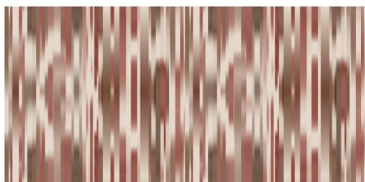
Foss SFS33 Cola (showing width: 68.5cm)