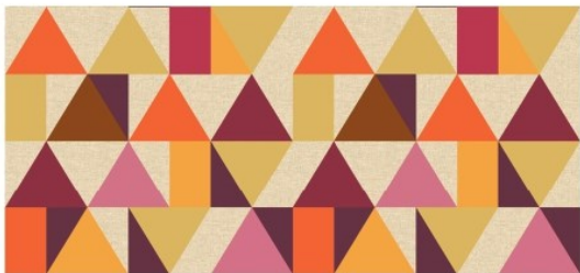
Henrick OS17 Sunset (showing width: 68.5cm)

For exact colour reference, please order a sample: skoposfabrics.com