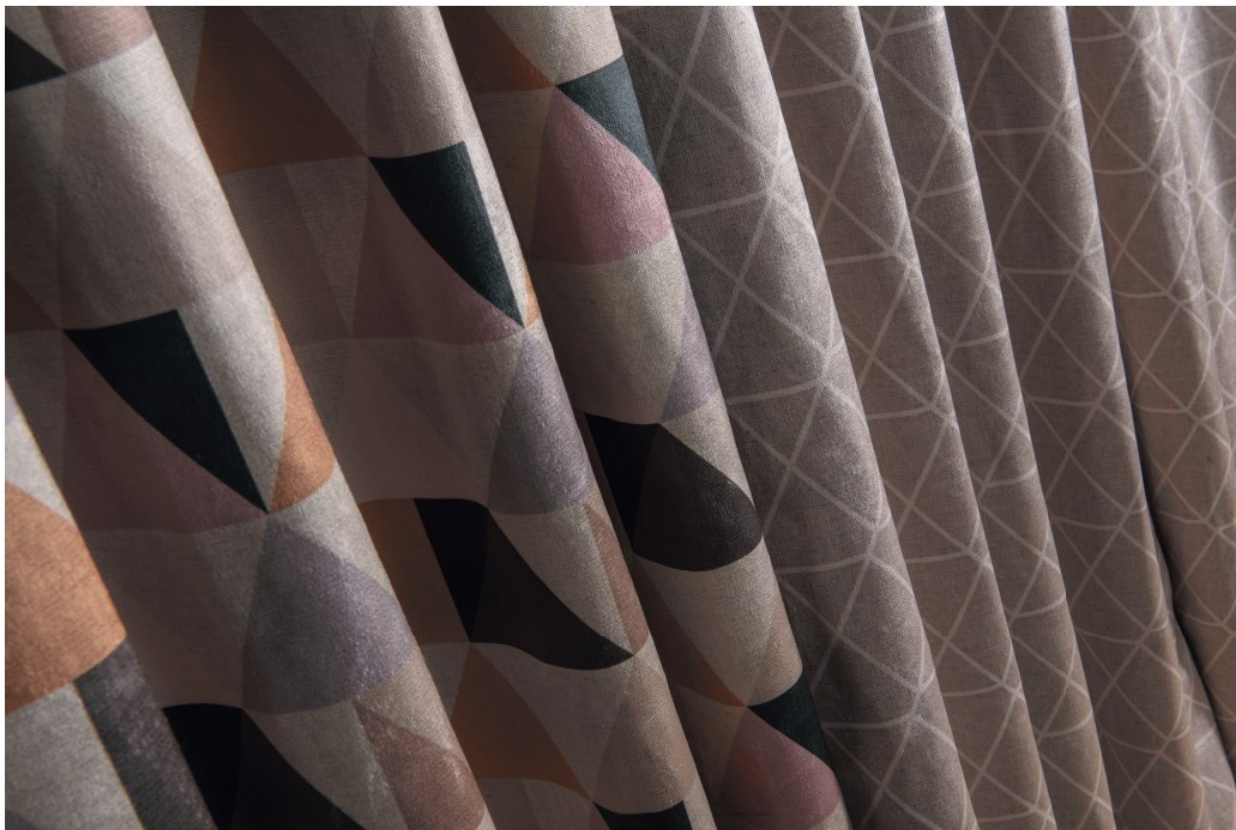
Image shows Henrick OS13 Umber and Timo OS25 Eider on the curtains.

All of Skopos printed designs are available on a wide choice of base-cloths, including velvets, waterproof upholstery fabrics, blackout fabrics and linen-looks. For details, please refer to our website. For all other designs within Oslo; please view the collection on the website.