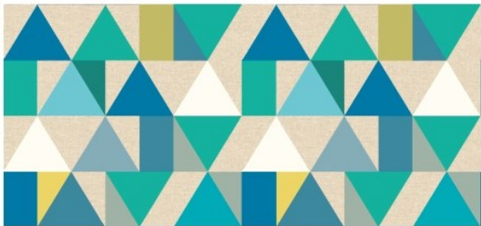
Henrick OS15 Fjord (showing width: 68.5cm)