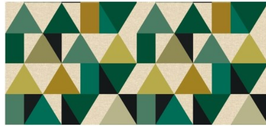
Henrick OS14 Spruce (showing width: 68.5cm)