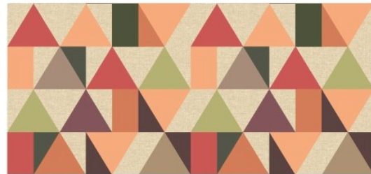
Henrick OS16 Carmine (showing width: 68.5cm)