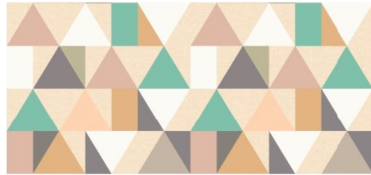
Henrick OS12 Salt Lake (showing width: 68.5cm)