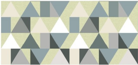
Henrik OS11 Goose (showing width: 68.5cm)

Sample swatch attached shows OS12 Salt Lake on Panama base-cloth.