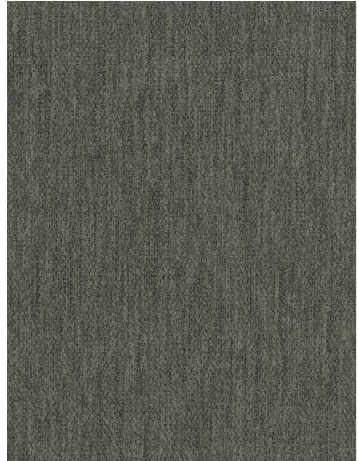
IN8 Wolf Cub