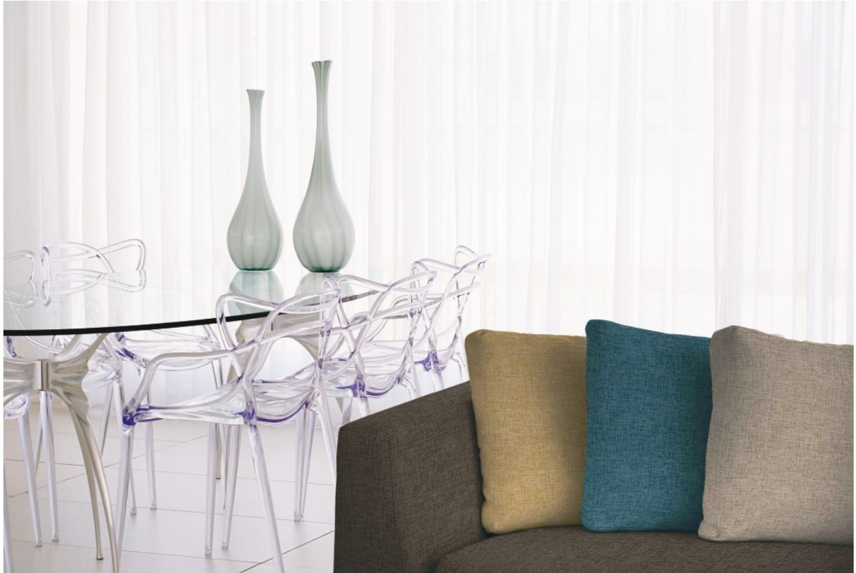
Image shows Lienzo SL11 Honeycomb, SL10 Persian and SL5 Latte on cushions and SL6 Espresso on sofa

All of Skopos printed designs are available on a wide choice of base-cloths, including velvets, waterproof upholstery fabrics, blackout fabrics and linen-looks. For details, please refer to our website. Skopos can also provide bespoke colour options for a minimum order quantity. Please contact us for further details.