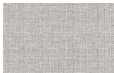
Lienzo SL3 Pumice