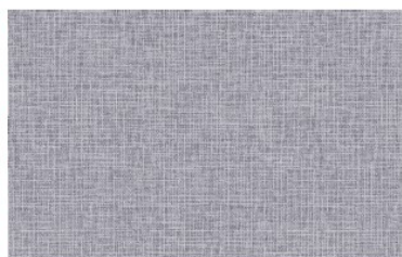
Lienzo SL4 Rhino