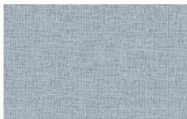
Lienzo SL7 Seafoam