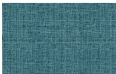
Lienzo SL10 Persian