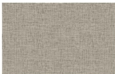
Lienzo SL5 Latte