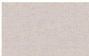
Lienzo SL1 Marzipan

Sample swatch attached shows SL8 Thyme on Turin base-cloth