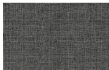
Lienzo SL6 Espresso