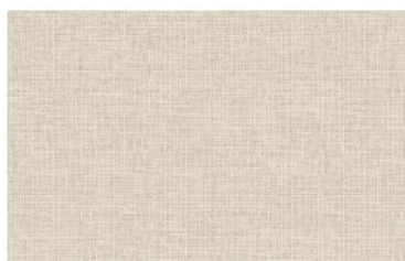
Lienzo SL2 Vanilla