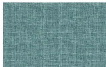
Lienzo SL9 Aquamarine