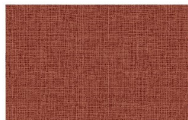
Lienzo SL12 Cinnamon