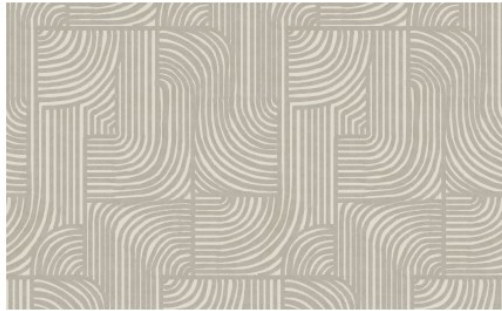
Lineaire SLN2 Mousy (showing width: 68.5cm)