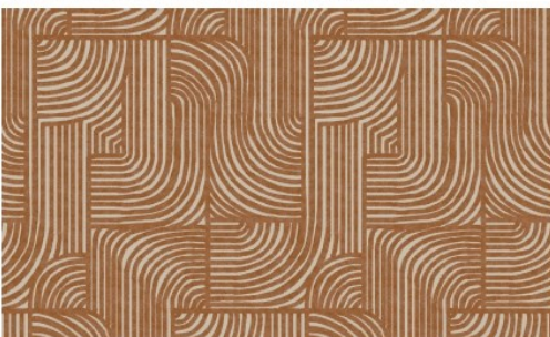
Lineaire SLN8 Tigers Eye (showing width: 68.5cm)