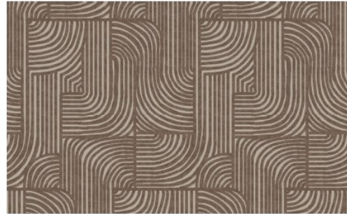
Lineaire SLN4 Brownie (showing width: 68.5cm)