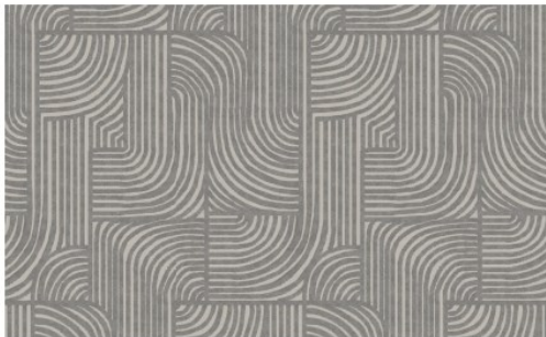
Lineaire SLN3 Hippo (showing width: 68.5cm)