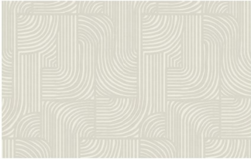
Lineaire SLN1 Marble (showing width: 68.5cm)

Sample swatch attached shows SLN5 Onyx on Capa base-cloth