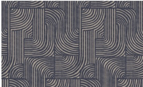
Lineaire SLN6 Night (showing width: 68.5cm)