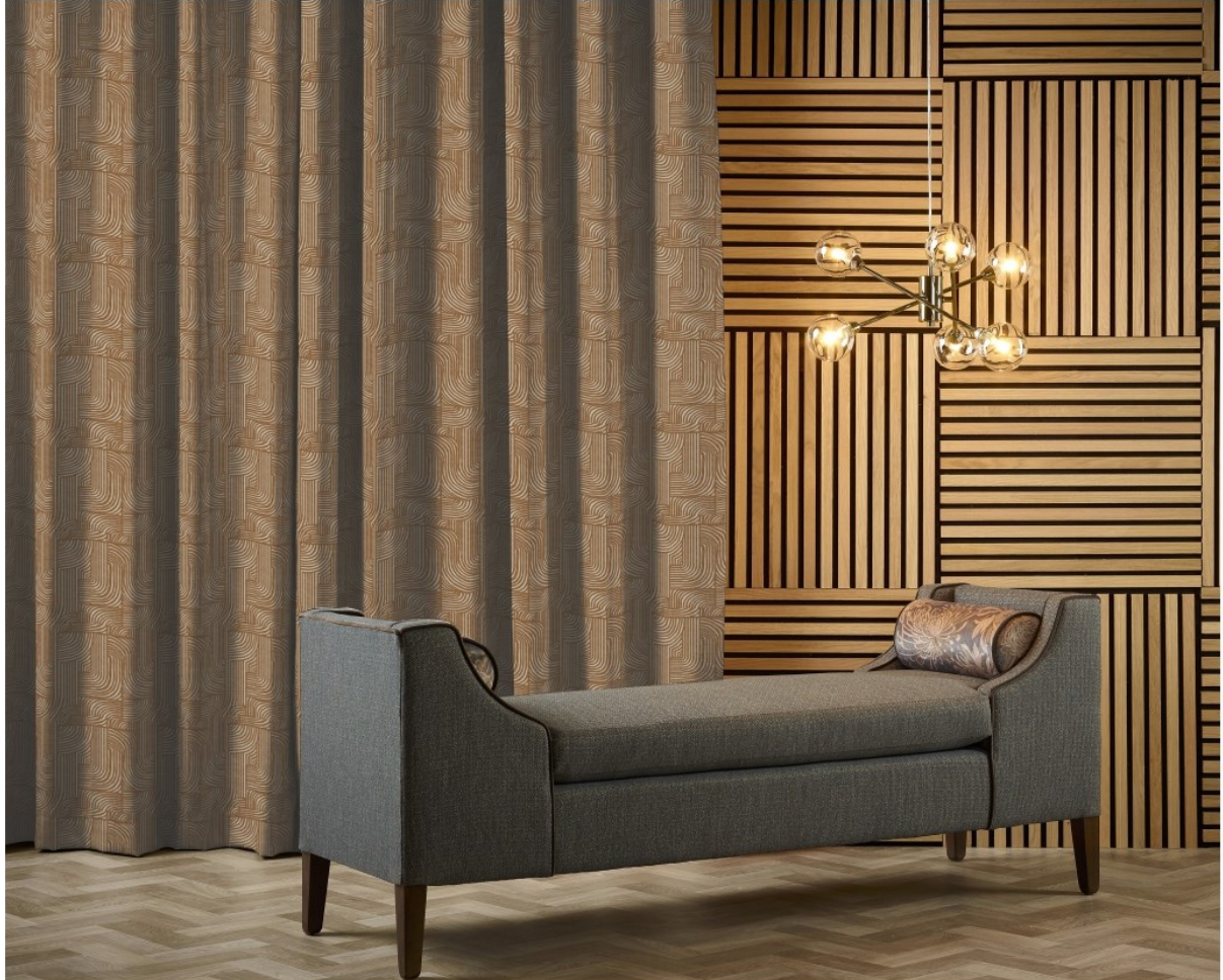
Image shows Lineaire SLN8 Tigers Eye on the curtains.

All of Skopos printed designs are available on a wide choice of base-cloths, including velvets, waterproof upholstery fabrics, blackout fabrics and linen-looks. For details, please refer to our website. Skopos can also provide bespoke colour options for a minimum order quantity.