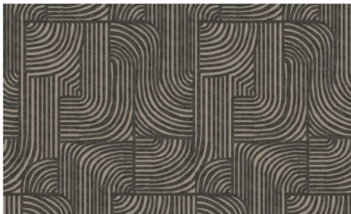
Lineaire SLN5 Onyx (showing width: 68.5cm)