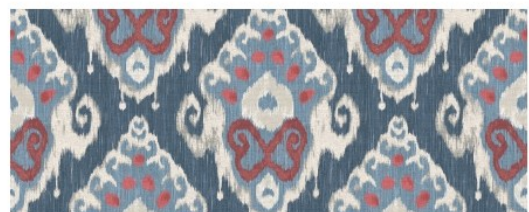
Patan SP8 Jubilee (showing width: 68.5cm)