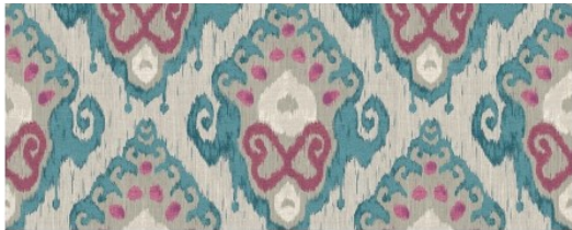
Patan SP1 Bermuda (showing width: 68.5cm)

Sample swatch attached shows SP9 Playa on Turin base-cloth.