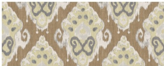
Patan SP5 Beach Comber (showing width: 68.5cm)