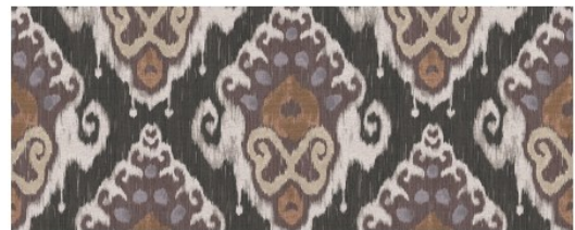
Patan SP6 Safari (showing width: 68.5cm)