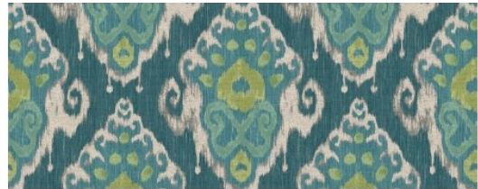
Patan SP2 Chameleon (showing width: 68.5cm)