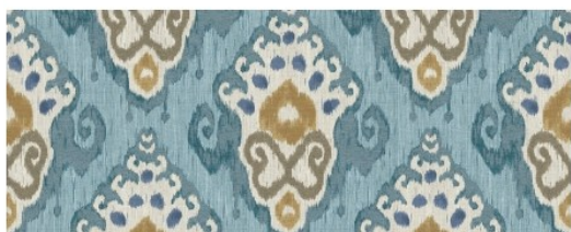
Patan SP9 Playa (showing width: 68.5cm)