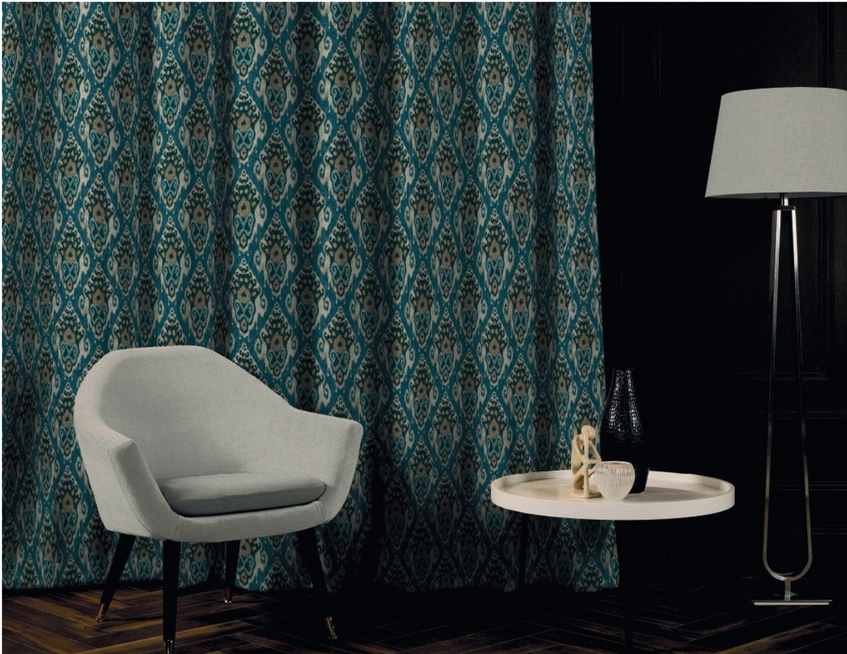
Image shows Patan SP10 Shallows on curtain.

All of Skopos printed designs are available on a wide choice of base-cloths, including velvets, waterproof upholstery fabrics, blackout fabrics and linen-looks. For details, please refer to our website. Skopos can also provide bespoke colour options for a minimum order quantity.