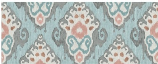
Patan SP3 Shell Island (showing width: 68.5cm)