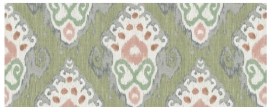
Patan SP4 Samphire (showing width: 68.5cm)