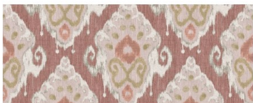
Patan SP7 Shrimp (showing width: 68.5cm)